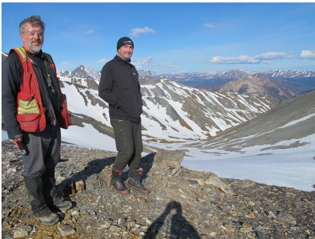
Figure 4: Field reconnaissance team at ReRun.