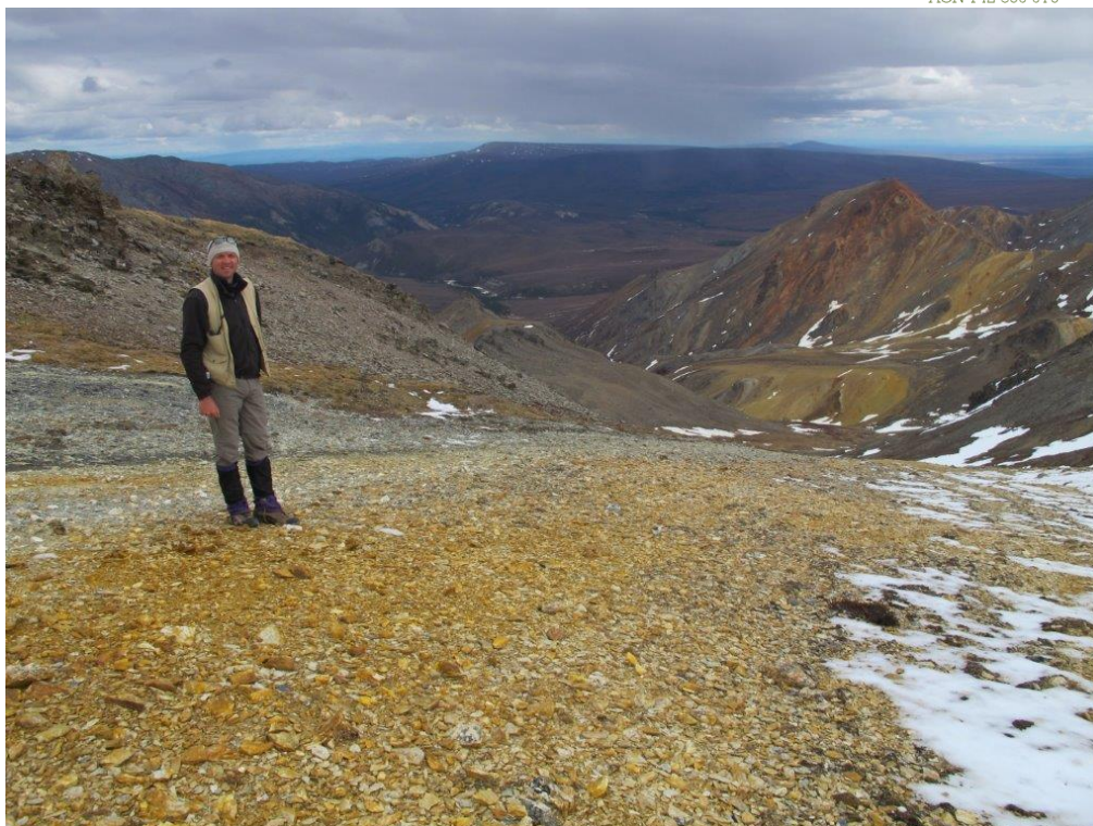
Figure 3: The Company's Exploration Manager at Dry Creek West looking west along strike within the footwall alteration zone, with Red Mountain in the background.